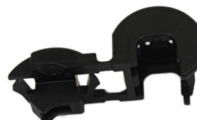
#300- White Snap Bushing for .625" Hole #300 BK- Black Snap in Bushing for .625" Hole .130"-.210" Cords