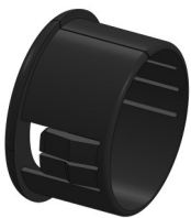
#288 Split Bushing for .625" Hole