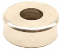
#131 1/2 " IP Threaded Female Bushing with center .4" Cord Hole .474"L x 1"W x .39" 1/2 IP Thread

#252- Round SJT Cord .375"-.420" Diameter