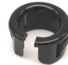
#154 Black Split Snap Bushing for .500" Hole #288 Plastic Black .625" Hole Split Insulated Hole Bushings .450" ID Heyco # 2872