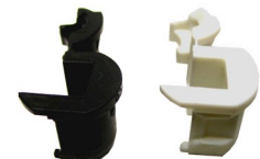
248BK 248 Lock-It Style Strain Relief for .625" PF Hole Fits .220"-.290" for SVT cord Locks around cord before insertion