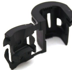
255 BK Lock-It Style Strain Relief for 1.109" PF Hole Fits .600"-.700" Cord

Coupler for Cord Grip, 1/8"IP Female Dimensions are .7"W X .675"H