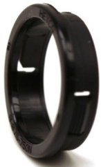
#237 .875" Hole Bushing Black Heyco Part# 2850N .945"W x .750"ID x .250"H x .063" Max Panel Thickness

#234- 1/8" Diameter Nylon Cable Strap W/ .210" Screw Hole Natural Heyco #3302