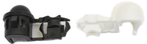
#299- White Snap Bushing for .875" Hole #299 BK- Black Snap in Bushing for .875" Hole .290"-.385" Cords