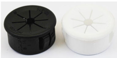
#290 & 290 BK Universal Bushing for .875" Hole Heyco 2129 Plastic White .875" Hole Universal Insulated Hole Bushing .560"