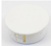
#292 Blank Hole Bushings for .875" Hole