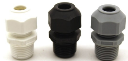
Cord Grip Bk/Wht/GY Strain Relief for .105"-.315" DIA Cord 18/3 SJT Cord x 3/8"IP Male 1.56"L x .746"Across Flats x .575" 3/8" Thread