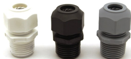
Cord Grip 1/2" IP Bk/Wht/GY Strain Relief for .170" - .450" DIA Cord (AMW, SJT, SVT) x 1/2" IP Male 1.72" L x 1.050" Across Flats x 1.144" 1/2" Thread