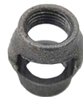
Barrel Hickey #29 -3/8"IP Tap x 3/8"IP Tap #163 -3/8"IP Tap x 1/2"IP Tap #164 -1/2"IP Tap x 1/2"IP Tap Raw Iron Malleable Hickies 1"H