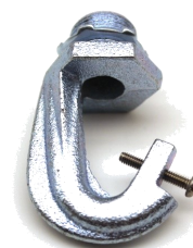
3/4 Hook 3/8"IP High Bay Hook W/ Set Screw