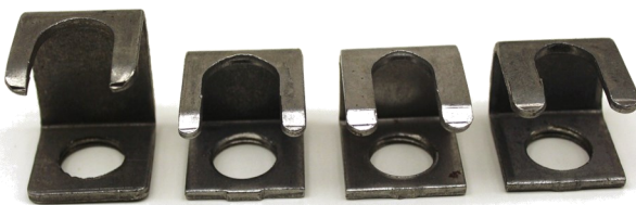
#27 -3/8" IP Slip Hickey x 3/8"IP Tap x 1.5" H, Malleable Iron #21 -3/8"IP Slip Hickey x 3/8"IP Tap x 1" H, Malleable Iron #36P - 3/8"IP Slip Hickey x 1/4"IP Tap x 1" H, Zinc Plated #36 - 3/8"IP Slip Hickey x 1/4"IP Tap x 1" H, Malleable Iron