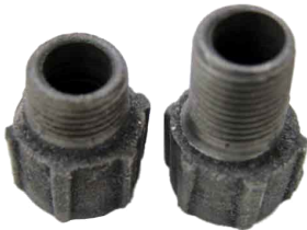
#80 - 3/8"IP x 1" #81 - 3/8"IP x 1 3/8" Iron Malleable Stud Extensions

Hardware for Support Clip #110 Bolt 1" - 1/4"-20 x 1" L Flat Head Square Neck Bolt for #110 BS In- dependent Support Clip. Sometimes used for Tegular style Drop Ceiling Tiles