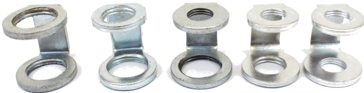
C Hickies #28 - 3/8"IP x 3/8"IP #140 - 3/8"IP x 1/4"IP #177 - 3/8"IP x 1/8"IP #258 - 1/4"IP x 1/8"IP #259 - 1/8"IP x 1/8"IP