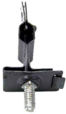
#110 1/4"-20 Stud 3/8"L Support Clip for T-Bar. Wraps around Acoustical T- Bar grid