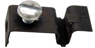
#132 Electrical Box Support Clip BHC Used for support wire for J-Box

Hardware for Support Clip #110 Bolt 1" - 1/4"-20 x 1" L Flat Head Square Neck Bolt for #110 BS In- dependent Support Clip. Sometimes used for Tegular style Drop Ceiling Tiles