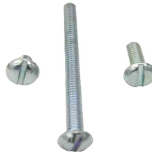
1/4"-20 Bolts Zinc Plated #69 -1/4-20 x 3/4" Bolt #69A -1/4-20 x 3/8" Bolt #69B -1/4-20 x 3" Bolt