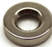
#Magnet #6 & #8 Magnet 1/2" O.D. x 1/8" Thick Magnet w/ 8/32" & 6/32" Countersunk Holes