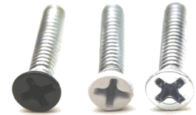
MP Screws 6/32" x 3/4" long zinc plated flat countersunk head machine screw. Available with Matte white, black or zinc finished heads