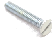
#211 8/32 Painted Screw 8/32" x 1" Slotted Flat Head Machine Screw White Painted Head