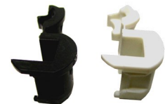
248BK 248 Lock-It Style Strain Relief for .625" PF Hole Fits .220"-.290" for SVT cord Locks around cord before insertion