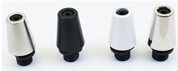
Micro CG Cap WHT-(Matte White Cap) Micro CG Cap BN- (Brushed Nickel Cap) Micro CG Cap BK- (Matte Black Cap) Micro CG Cap NK-(Nickel) Micro CG Cap GY-(Gray)

Cord Grip Cap 1/8"IP Female W/ 1/8"IPS CG Plastic Base For .125"-180" Diameter Round Cord Intertek certified to UL #635 standard