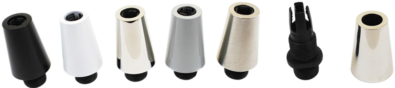
CG CAP WHT SJT -(Matte White Cap) CG Cap BN SJT - (Brushed Nickel Cap) CG Cap BK SJT - (Matte Black Cap) CG Cap NK SJT -(Nickel) CG Cap GY SJT -(Gray)

Check ring for CG Base part of CG CAP (Part shown on Left) when mounting CG Base on surface of fixture