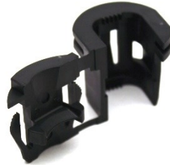
255 BK Lock-It Style Strain Relief for 1.109" PF Hole Fits .600"-.700" Cord

Coupler for Cord Grip, 1/8"IP Female Dimensions are .7"W X .675"H