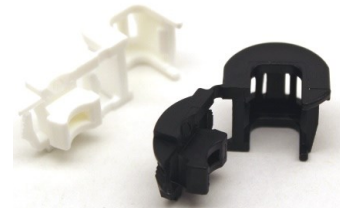
171 WHT/BK 7/8"(.875") KO Strain Relief for 18/3, 18/4 & 18/5 SJT Cord Connector Snaps and Locks around Cord Fits .290"-.385" cord