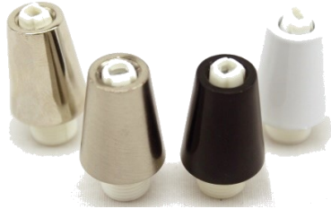
CG Cap WHT-(Matte White Cap) CG Cap BN- (Brushed Nickel Cap) CG Cap BK- (Matte Black Cap) CG Cap NK-(Nickel)

Cord Grip Cap 1/8"IP Female W/ CG Plastic Base for .190"-260" Diameter Round Cord Intertek certified to UL #635 standard