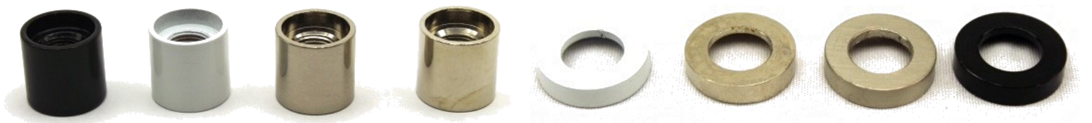
CG Coupler WHT-(Matte White) CG Coupler BN- (Brushed Nickel) CG Coupler BK- (Matte Black) CG Coupler NK-(Nickel)

No Thread (NT) Base with Flange Intertek certified to UL #635 standard