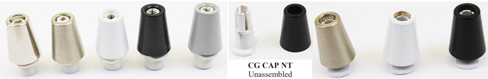
CG Cap WHT-(Matte White Cap) CG Cap BN- (Brushed Nickel Cap) CG Cap BK- (Matte Black Cap) CG Cap NK-(Nickel) CG Cap GY-(Gray)

Cord Grip Cap 1/8"IP Female W/ 1/8"IPS CG Plastic Base For .125"-180" Diameter Round Cord Intertek certified to UL #635 standard