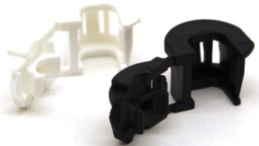
126 WHT/BK Lock-It Style Strain Relief for .875" PF Hole for 12/3, 14/3, 14/4 & 18/5 .380"-.450" cord