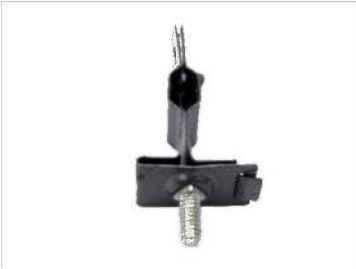
#110 1/4"-20 Stud 3/8"L Support Clip for T-Bar. Wraps around Acoustical T- Bar grid