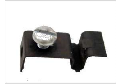
#132 Electrical Box Support Clip BHC Used for support wire for J-Box