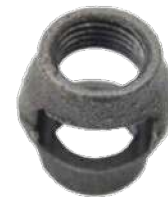
Barrel Hickey #29 -3/8"IP Tap x 3/8"IP Tap #163 -3/8"IP Tap x 1/2"IP Tap #164 -1/2"IP Tap x 1/2"IP Tap Raw Iron Malleable Hickeys 1"H