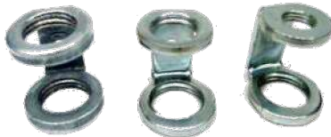
C Hickey #28 - 3/8"IP x 3/8"IP #140 - 3/8"IP x 1/4"IP #177 - 3/8"IP x 1/8"IP "C" Hickeys 1" High 7 Gauge 3/8"IP Tap x 3/8"IP Tap x 1"L