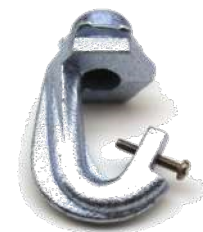
3/4 Hook 3/8"IP High Bay Hook W/ Set Screw