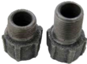
#80 - 3/8"IP x 1" #81 - 3/8"IP x 1 3/8" Iron Malleable Stud Extensions