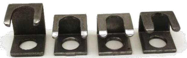
#27 -3/8" IP Slip Hickey x 3/8"IP Tap x 1.5" H, Malleable Iron #21 -3/8"IP Slip Hickey x 3/8"IP Tap x 1" H, Malleable Iron #36P - 3/8"IP Slip Hickey x 1/4"IP Tap x 1" H, Zinc Plated #36 - 3/8"IP Slip Hickey x 1/4"IP Tap x 1" H, Malleable Iron