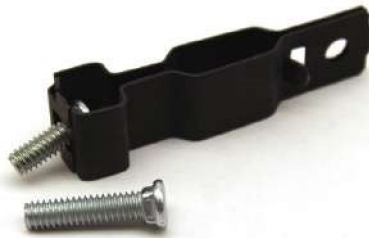
#110 BS - 1/4"-20 Independent T- Bar Support Clip for Bolt Slot Drop Ceiling Grid #110 Bolt 1" - 1/4"-20 x 1" L Flat Head Square Neck Bolt for #110 BS In- dependent Support Clip. Sometimes used for Tegular style Drop Ceiling Tiles